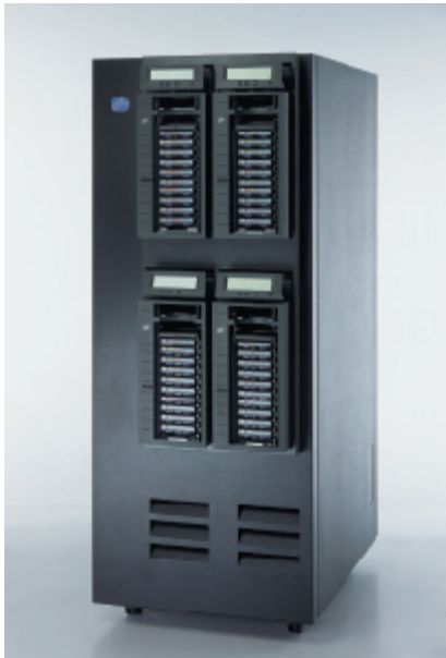
Frame-mounted 3590 Model E11