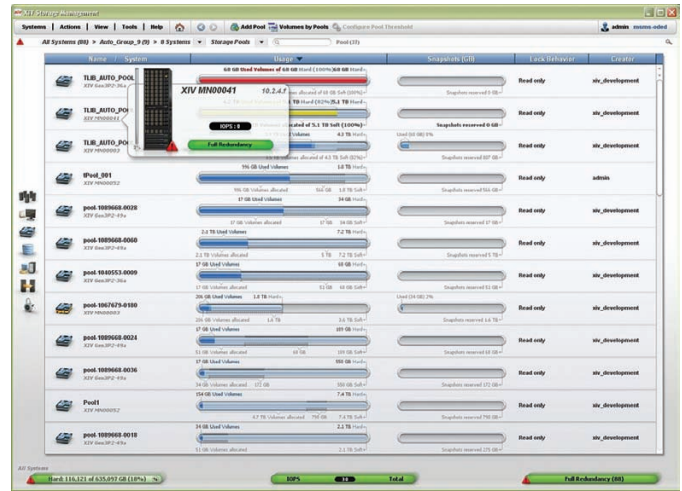
IBM Hyper-Scale: Consolidated management across XIV systems

The XIV architecture is at the core of the system’s seamless scaling-up capability. The system hardware scales in every aspect: each newly added module contains capacity, cache, flash caching (optional), processing power, host interfaces and bandwidth. This design is aimed at maintaining the capacity-to-resources ratio as the system scales up incrementally, keeping performance in pace with application load and total throughput. The XIV system software contains a redistribution mechanism that integrates a new module automatically, allowing for perfect linear scalability with near-zero performance impact. Internal switching capacity is designed for any system size, ensuring that the system stays bottleneck-free even upon scaling.