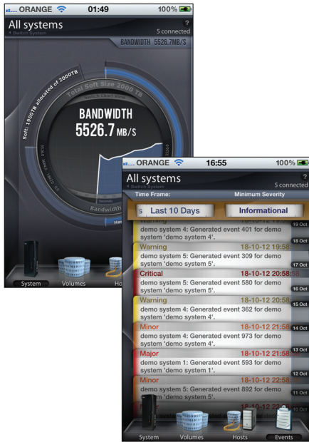
XIV Mobile Dashboard for on-the-go monitoring via iOS and Android devices