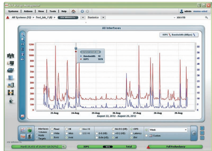
Consolidated view of XIV storage metrics for in-depth analysis